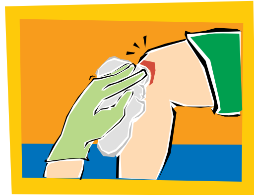
2. Provide appropriate care.