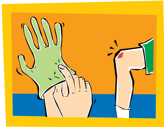
1. Put on a clean pair of gloves.