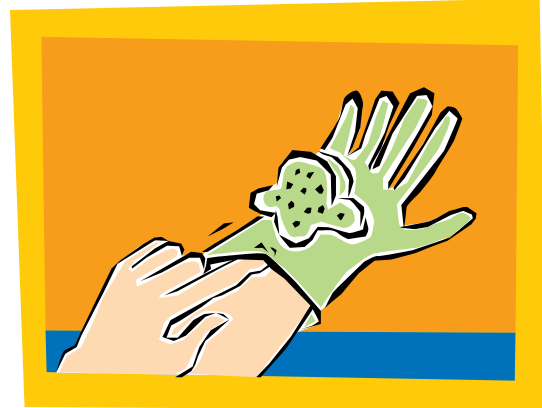
4. Ball up the dirty glove in the palm of the other gloved hand.