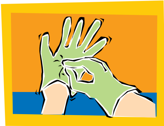
3. Remove each glove carefully. Grab the first glove at the palm and strip the glove off. Touch dirty surfaces only to dirty surfaces.