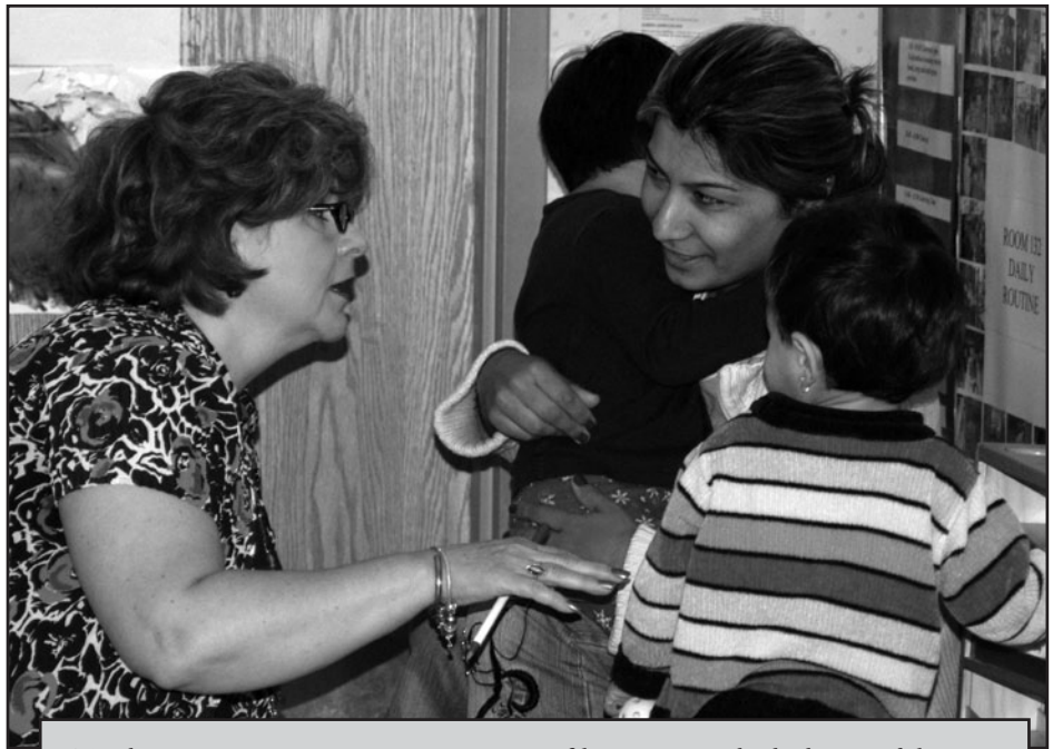
Subjects & Predicates

Electronic resources and communications can be part of facilitating this community of learners. Use of media must be guided by the same standards as other areas of professional practice. Among the core values of the NAEYC Code of Ethical Conduct are “relationships based on trust and respect” and respect for the “dignity, worth, and uniqueness of each individual.” Avoid making any