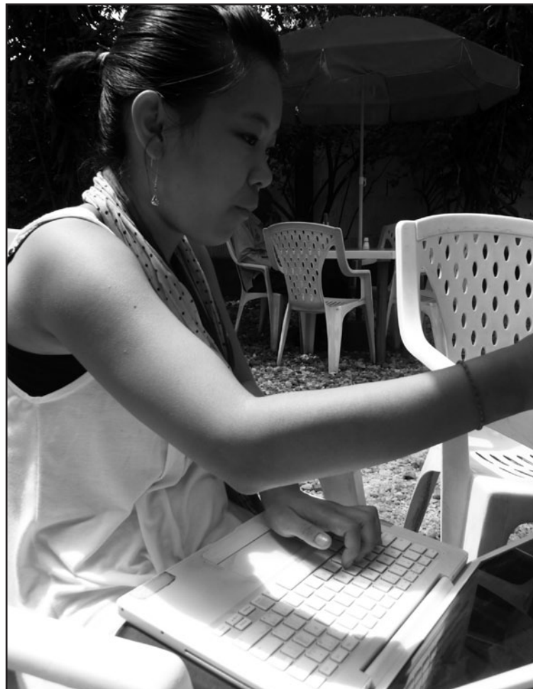
Subjects & Predicates

Social networking sites, such as MySpace and Facebook, allow participants to connect, maintain contact, and communicate with others (Cain, 2008). Members can share comments, videos, and photographs. Unfortunately, some users do not