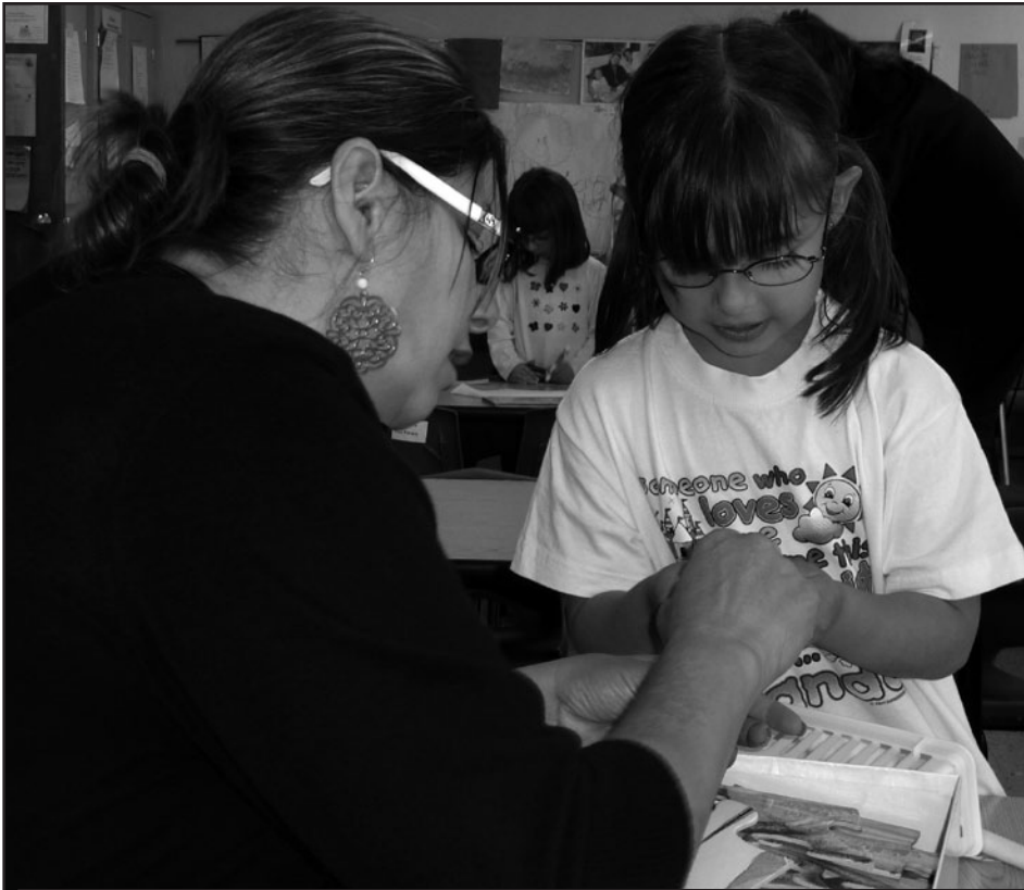
Subjects &amp; Predicates

Professionalism is a lifelong process that involves enhancing knowledge and skills while managing ethical responsibilities to children, families, colleagues, employers, and society.